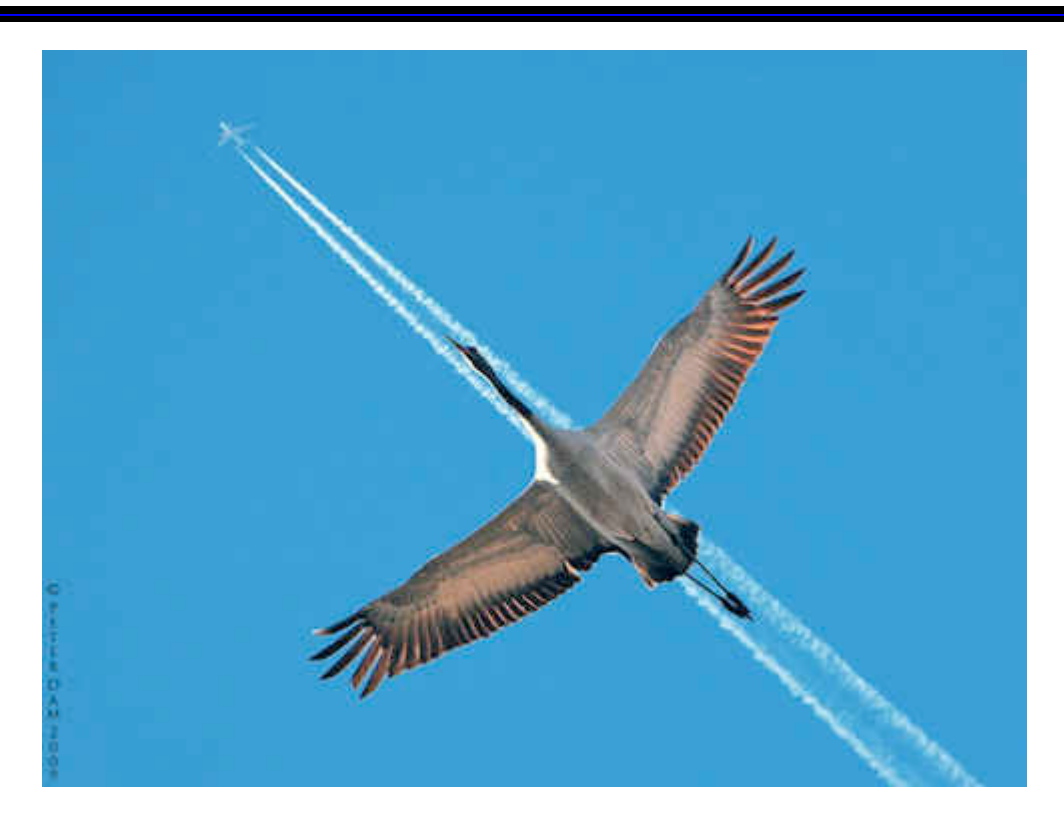
Everyone wants to be the big bird!