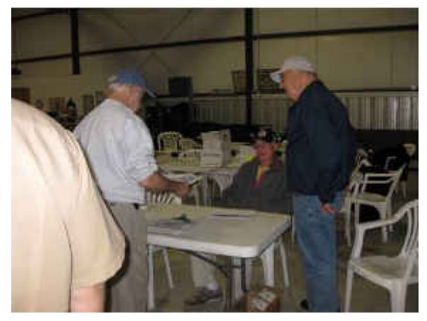
The hard working ground crew