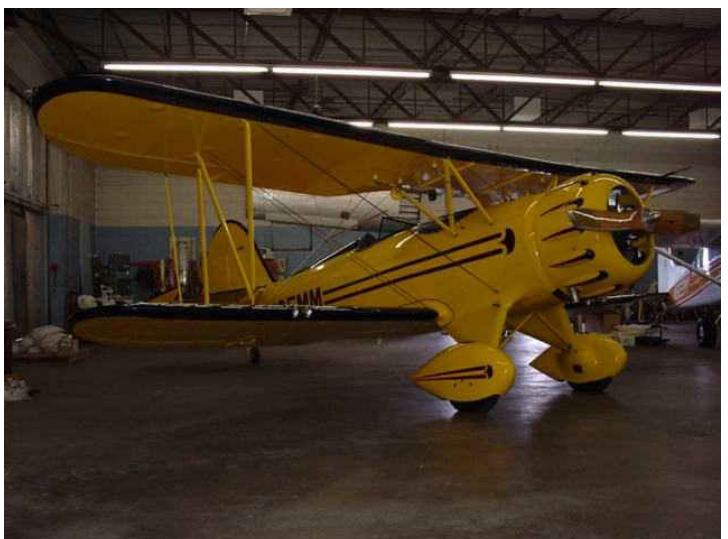
These two beautiful Wacos were in the FBO Hangar at Mt. Hawley for three windy days several weeks ago.